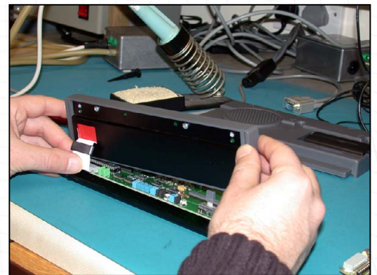
Fig. 1 – Fitting the MS20 Panel